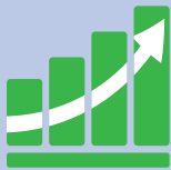
California Annual New Light Vehicle Registrations - 2008 thru 2019